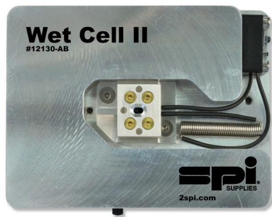
Figure 1. Top view of Wet Cell II