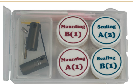
05240-AB K-kit System: Accessory Box $ 50.00

Each specimen cell is in its own carrier which includes a clear cap, a carrier with K-kit sitting on top of the plate and a bottom compartment housing a copper grid. The carrier is designed as a protective container during storage and shipment. It also serves as sample preparation facilitator and thus, the K-kit stays on the carrier plate for the entire sample preparation protocol until after the copper grid is attached. Specimen preparation tools and adhesives for sealing the chamber are available.