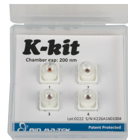
05248-AB K-kit Sampler: (2) 200nm and (2) 2.0um chamber height $ 400.00