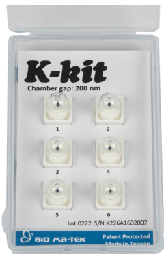
05245-AB K-kit A: Chamber Height 200nm, Pkg 6 $ 600.00