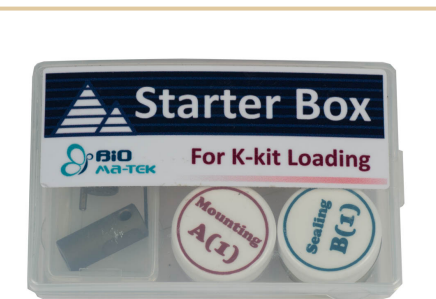
05243-AB K-kit System: Starter Box $ 50.00