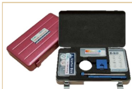
05244-AB K-kit System: Tool Box $ 500.00