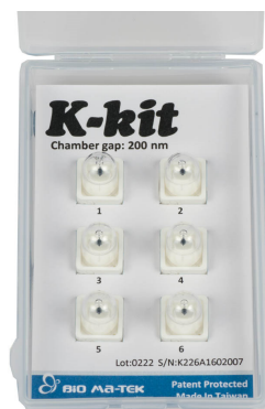
05246-AB K-kit B: Chamber Height 2.0um, Pkg 6 $ 600.00