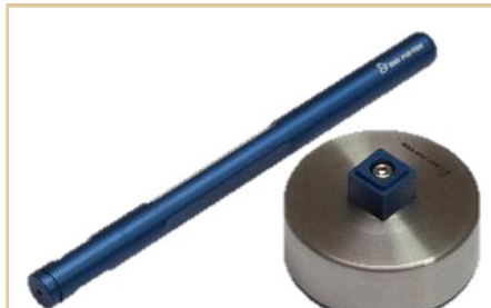
05241-AB K-kit System: Glue Station Tool Set $ 220.00