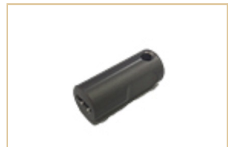
05247-AB K-kit System: Channel Tip $ 25.00